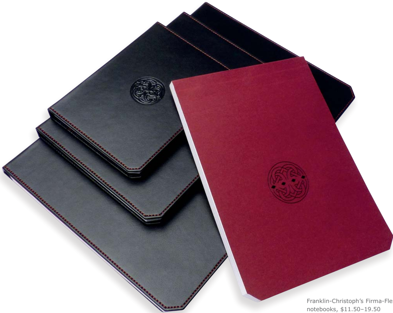
Franklin-Christoph's Firma-Flex notebooks, $11.50–19.50

Franklin-Christoph offers a line of papers made from sugar cane.