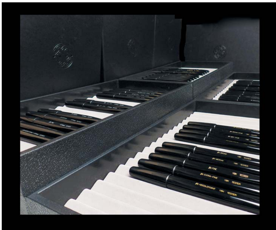
Franklin-Christoph's nib testing kit travels the pen show circuit.

particularly cost-effective, but it does give Franklin-Christoph an edge: the products are constantly being tweaked, and the improved versions can make their way to consumers that much faster. The Firma-Flex material has been upgraded, and new perimeter stitching in subtle color variations coordinates with the page printing, such as dark maroon stitching for ruled paper. Many customers have asked for loose-leaf paper, which is being added to the collection as well.